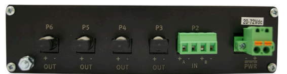
Back Panel Copper input with 4 x Fiber outputs