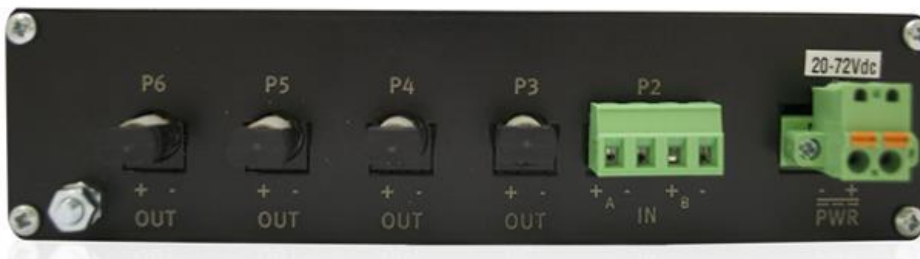
Rear Panel – Inputs/Outputs (Fiber out)